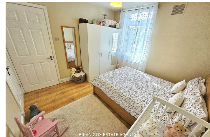
BRIAN COX ESTATE AGENTS