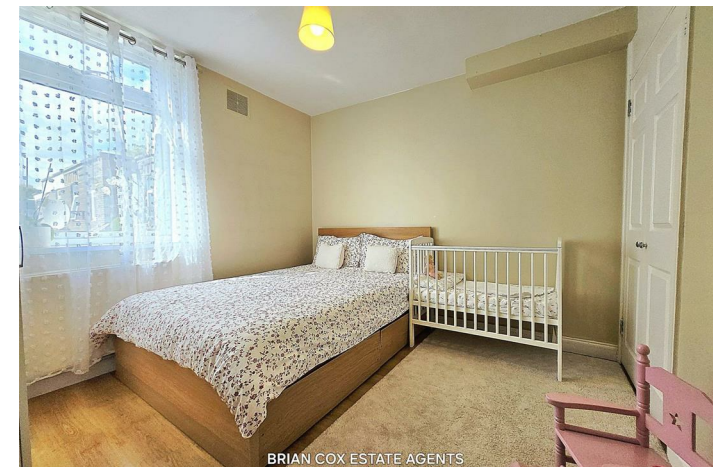
BRIAN COX ESTATE AGENTS