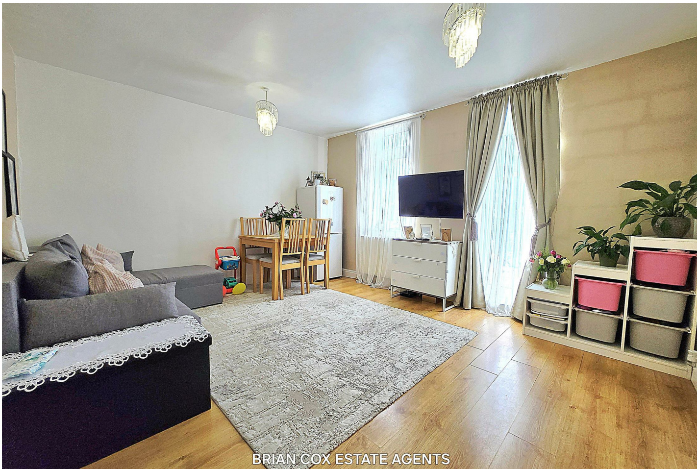
BRIAN COX ESTATE AGENTS